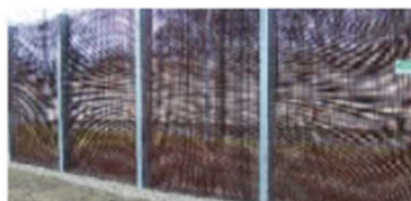
11. ARMAWEAVE® PLUS CPNI APPROVED FENCING