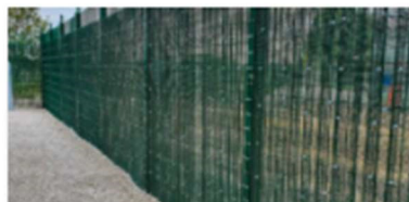
05. CORRUSEC C5 (SR3) RATED FENCING