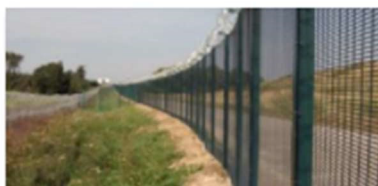
07. HISEC 358