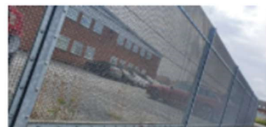
12. ARMASADE RETROFIT PALISADE