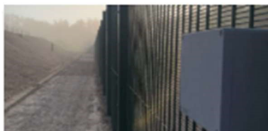
04. HISEC SR2 (B3) RATED FENCING