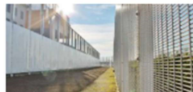
09. HISEC PRISON