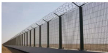
10. HISEC PLUS