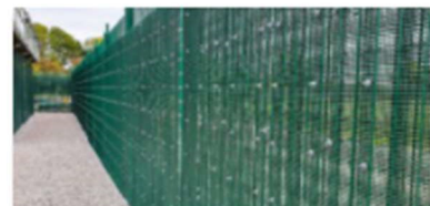
06. CORRUSEC D10 (SR4) RATED FENCING