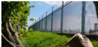
01. ARMAWEAVE® CPNI APPROVED FENCING

Zaun's perimeter security fencing systems range is designed, developed, and manufactured in our purpose-built factories in Wolverhampton in the West Midlands.