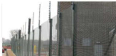
02. HISEC SUPER 6 CPNI APPROVED FENCING