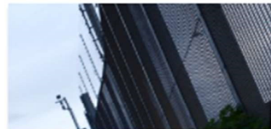
03. HISEC SR1 (A1) RATED FENCING