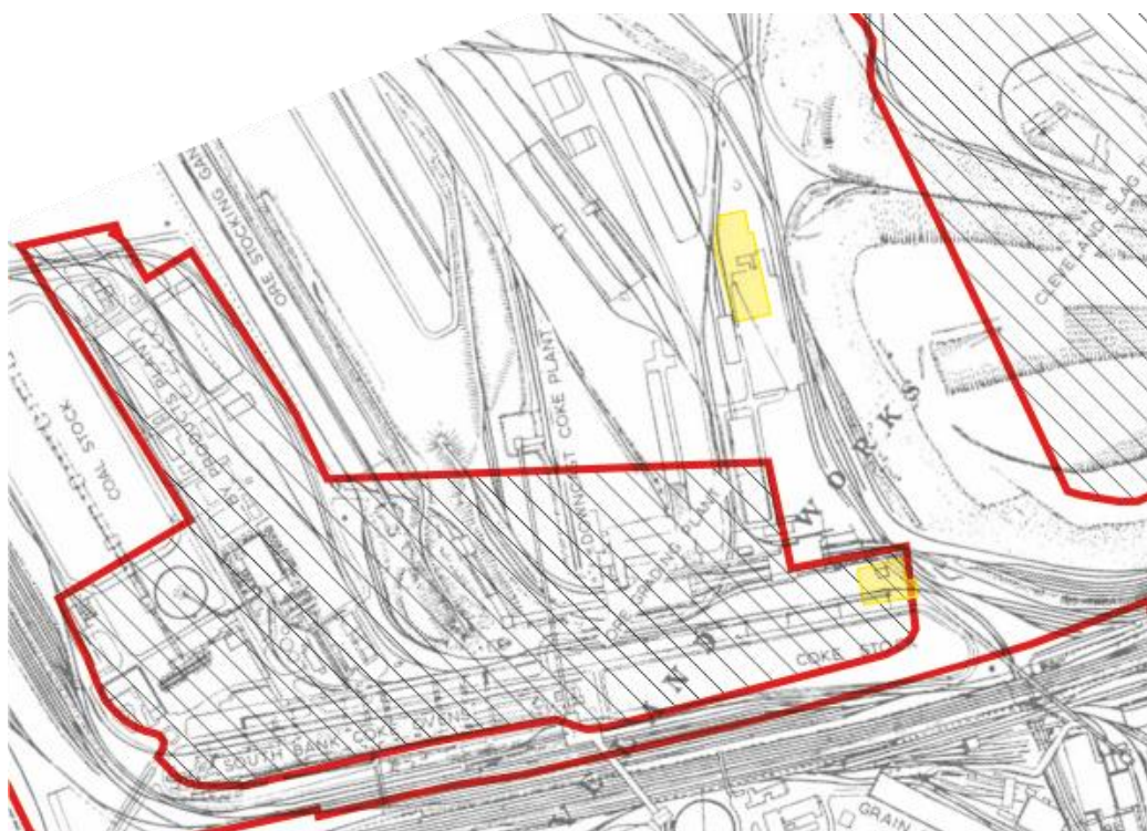
Figure 3: 1960s plan showing 19 th century structures (yellow) and areas excluded from development (hatched)