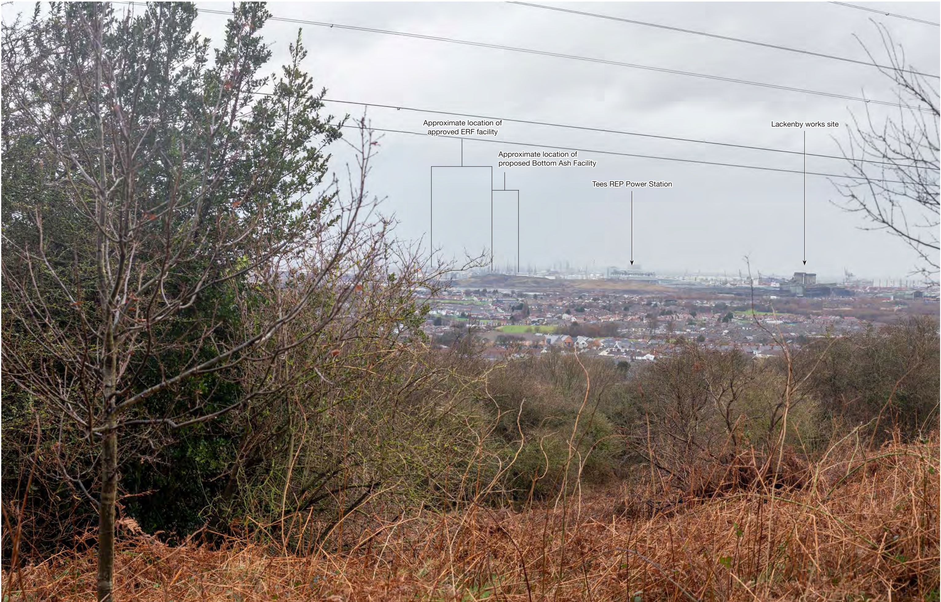
Viewpoint 9 – Representative viewpoint taken from the public right of way, route 122/39A/1, looking north west Annotated viewpoint photographs. To be viewed at a comfortable arm’s length and printed at A1

Tees Valley Bottom Ash Facility Viridor Waste Limited