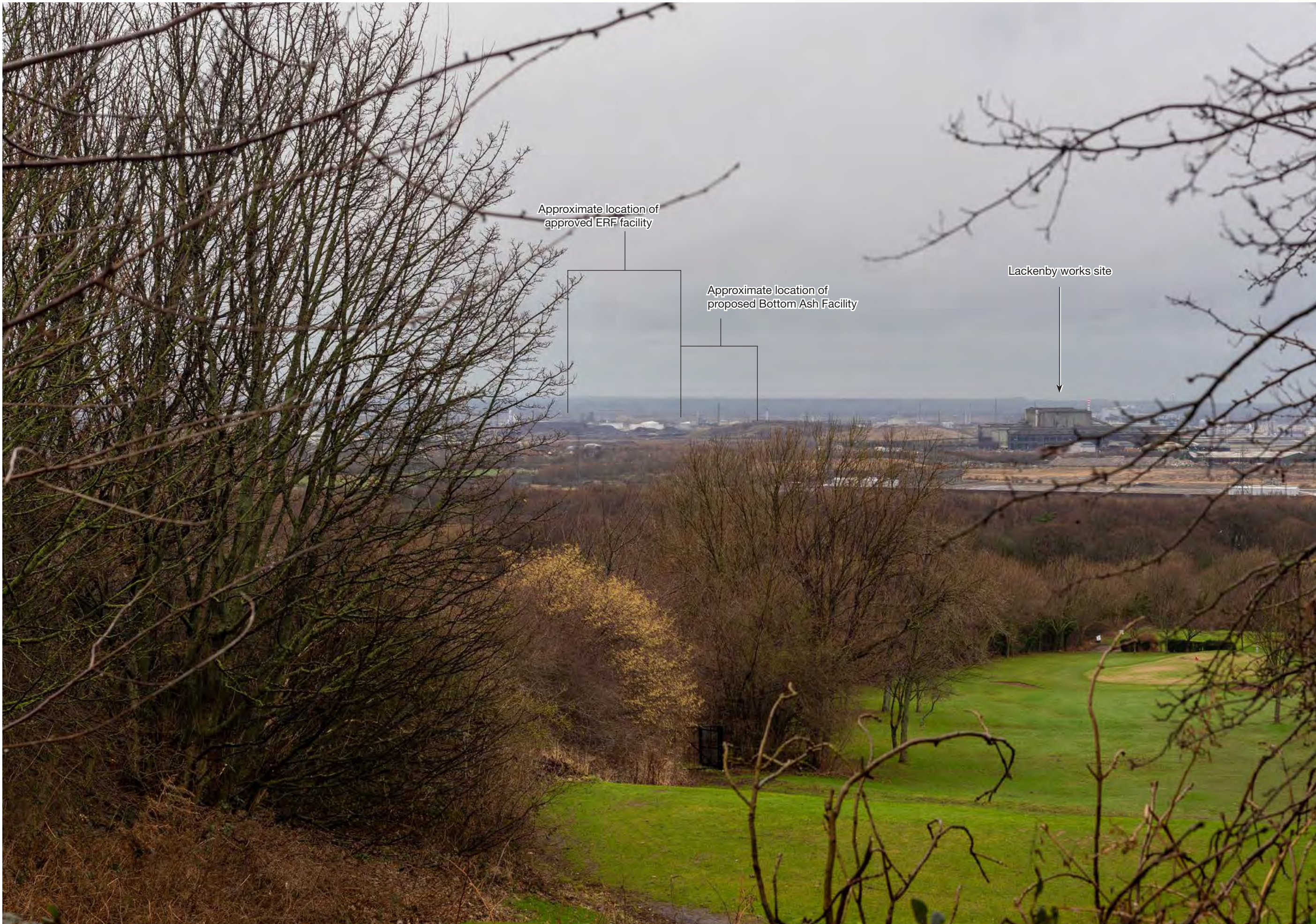
Viewpoint 8 – Representative viewpoint taken from the public bridleway, route 124/179/1, looking north west Annotated viewpoint photographs. To be viewed at a comfortable arm's length and printed at A1

Tees Valley Bottom Ash Facility Viridor Waste Limited