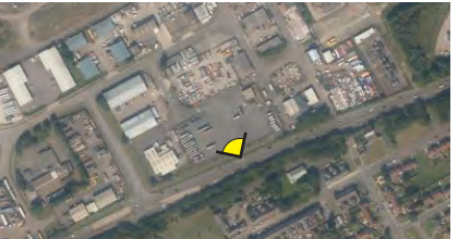
Figure 11 Representative viewpoint 4