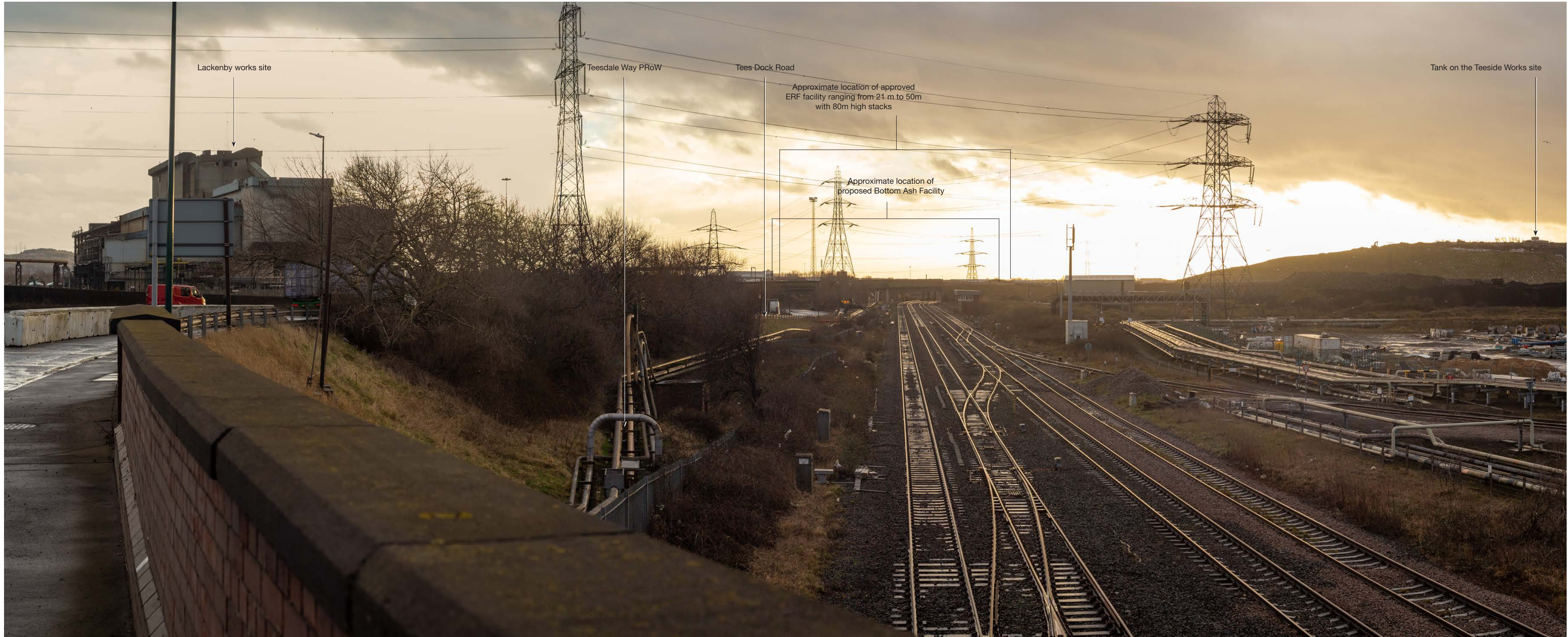
Viewpoint 1 – Representative view from footpath adjacent to Tees Dock Road, A1053, as it passes over the railway, looking west, south west Annotated viewpoint photographs. To be viewed at a comfortable arm's length and printed at A1