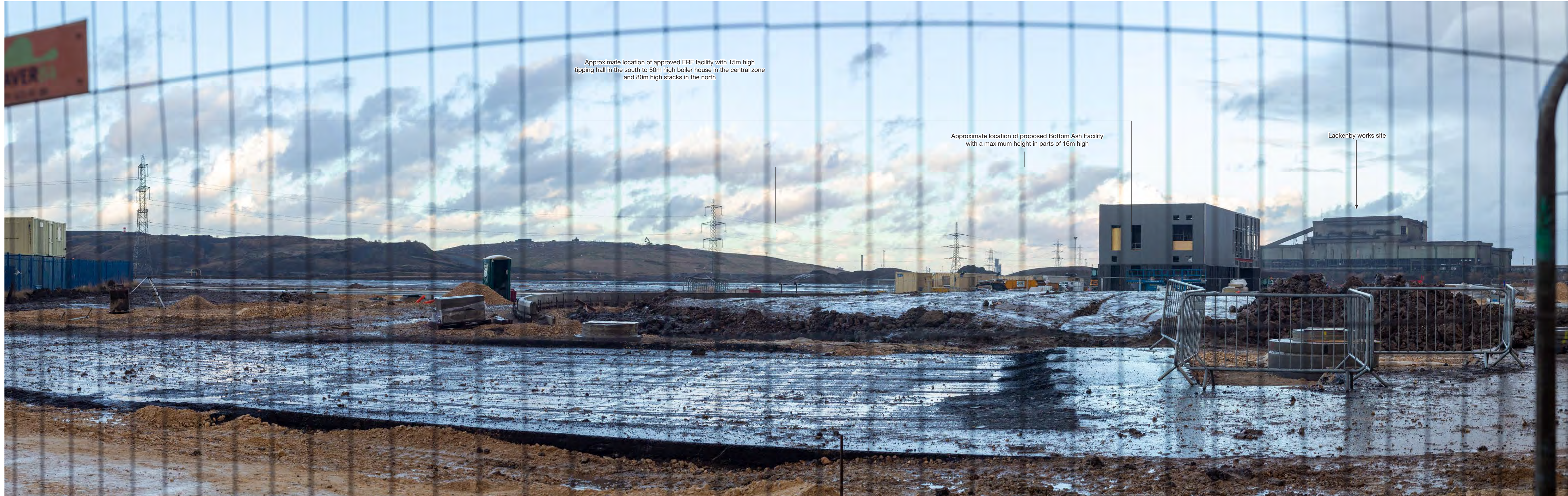
Viewpoint 3 – Representative viewpoint taken from the footway adjacent to Eston Road, looking east Annotated viewpoint photographs. To be viewed at a comfortable arm's length and printed at A1