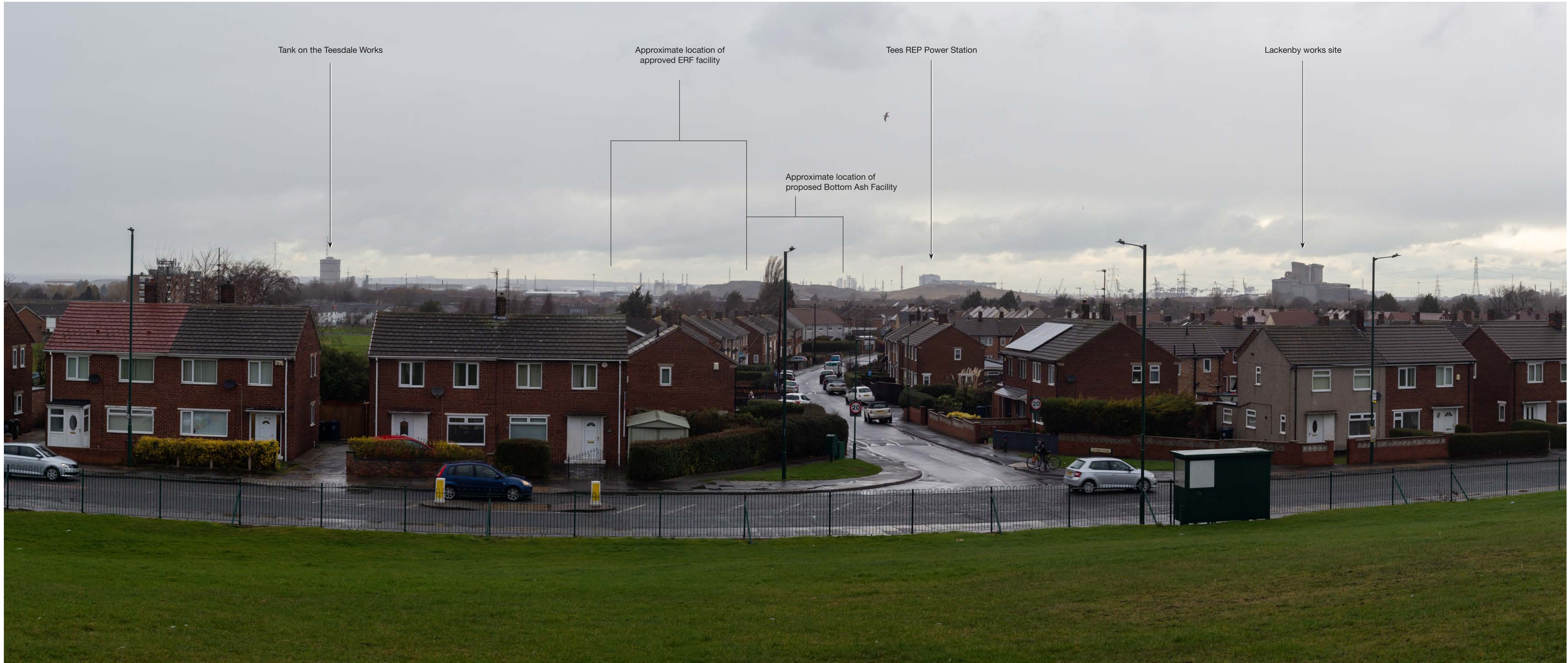
Viewpoint 6 – Representative viewpoint taken from the public open space south of Fabian Road, looking north, north west Annotated viewpoint photographs. To be viewed at a comfortable arm's length and printed at A1