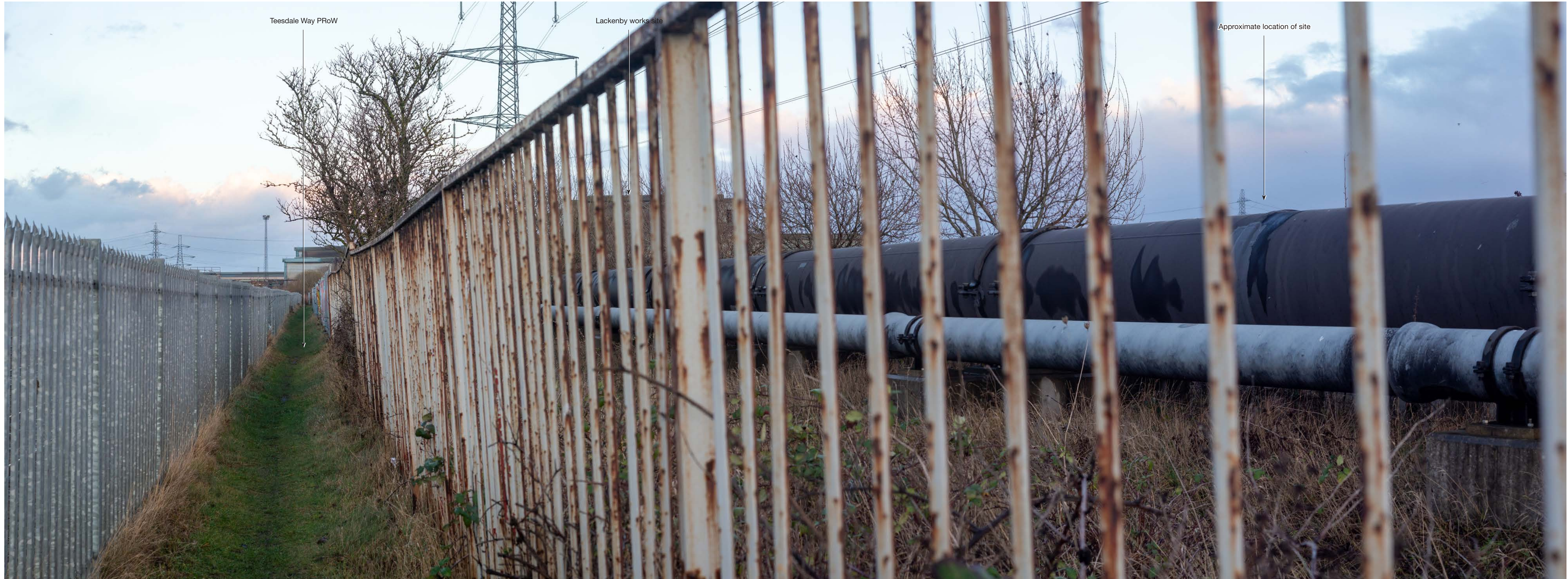
Viewpoint 2 – Representative view from the Teesdale Way Long Distance Footpath, route code 102/2/1, directly north of the site looking east, south east Annotated viewpoint photographs. To be viewed at a comfortable arm's length and printed at A1