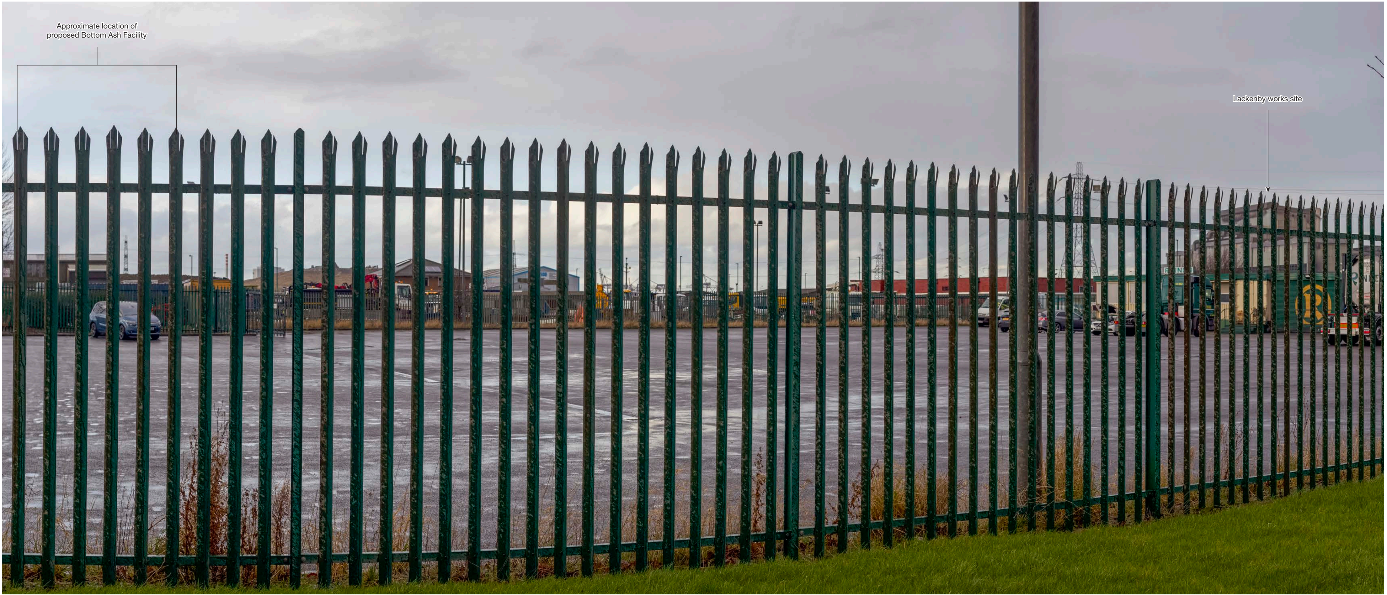
Viewpoint 4 – Representative viewpoint taken from the footway adjacent to A66, looking north, north west across Bolckow Industrial Estate Annotated viewpoint photographs. To be viewed at a comfortable arm's length and printed at A1