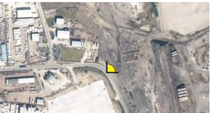
Figure 10 Representative viewpoint 3