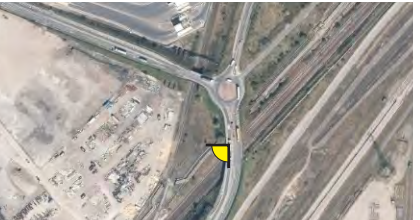
Figure 8 Representative viewpoint 1