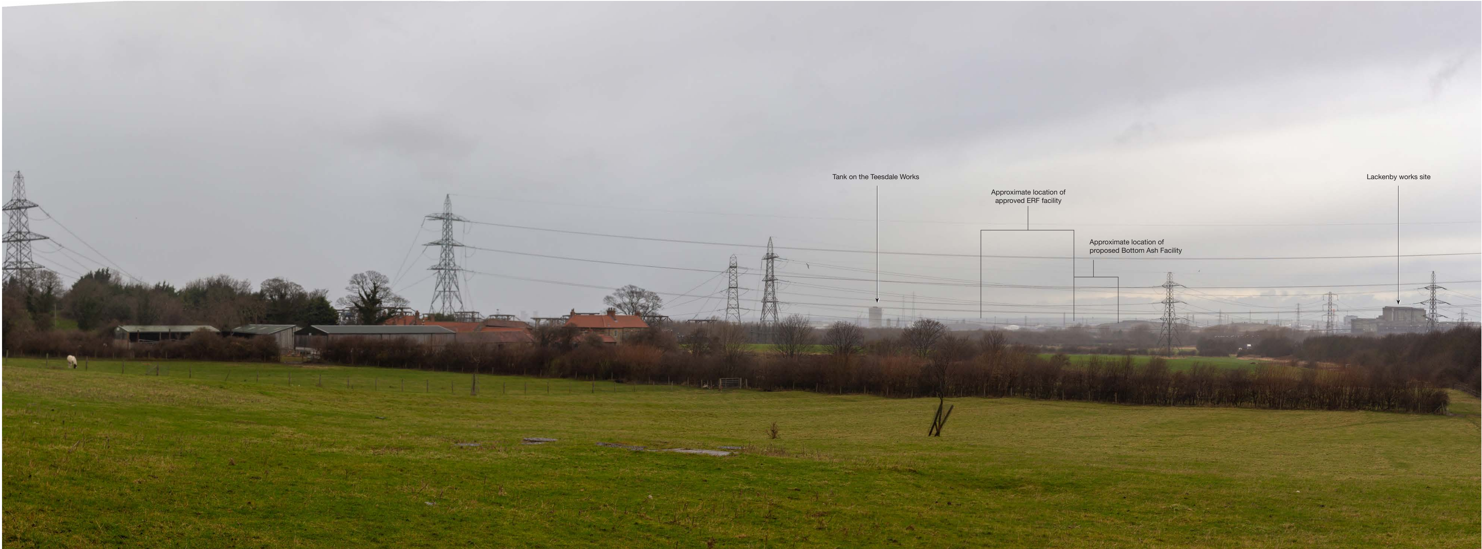
Viewpoint 7 – Representative viewpoint taken from the National Cycle Network Route 1 adjacent to the B1380, High Street at Eston, looking north west Annotated viewpoint photographs. To be viewed at a comfortable arm's length and printed at A1